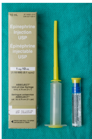
Figure 1: Prefilled syringe of epinephrine 1 mg/10 mL for intracardiac administration has a nonremovable 8.7 cm (3.5 inch) needle attached. From left to right: outer package, syringe, and cartridge.

Learning from this incidental finding also informs considerations that may come into play in the event that one of the epinephrine products is back-ordered. In this