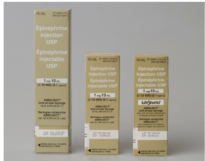
Figure 4: The outer packaging for the 3 types of prefilled syringes of epinephrine 1 mg/10 mL discussed in this safety bulletin.