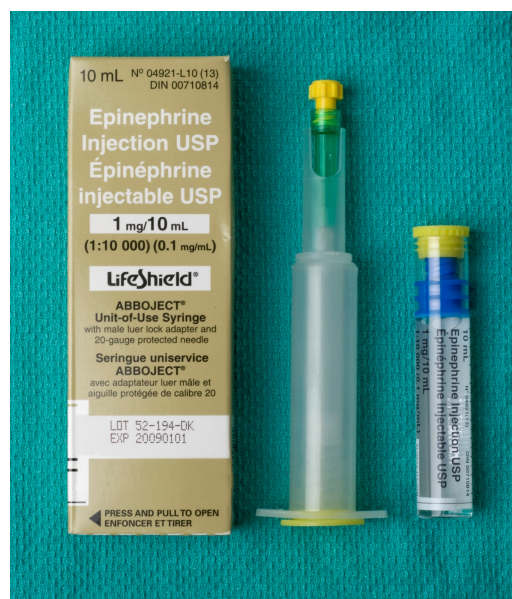
Figure 2: LifeShield prefilled syringe of epinephrine 1 mg/10 mL, has a "shield" surrounding the nonremovable 3.81 cm (1 inch) needle. The product has a luer-lock tip, which makes it compatible with needleless IV tubing. From left to right: outer package, syringe, and cartridge.