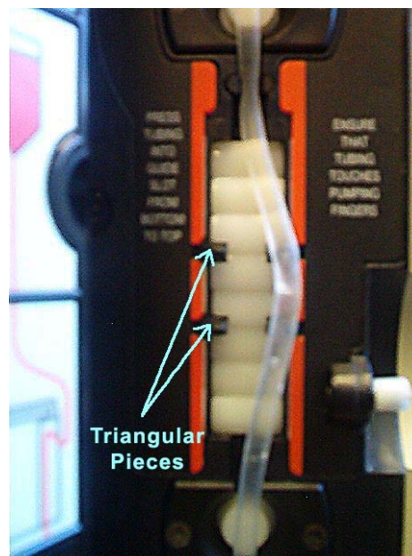
Figure 2. No flow replicated.

Tubing incorrectly loaded in curved manner between red lines did not activate pump alarm.