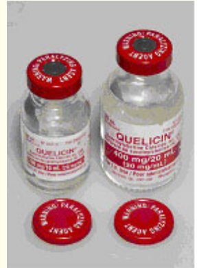
Figure 1: Succinylcholine vials with a red cap, red ferrule with the words: “WARNING: PARALYZING AGENT”.

ISMP Canada commends the manufacturers who have implemented the ideal features in their packaging and labelling of neuromuscular blockers and encourages all manufacturers to do so. †