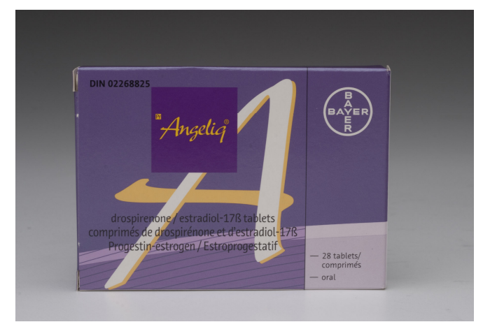
Figure 1: The front panel of the outer package for Angeliq.