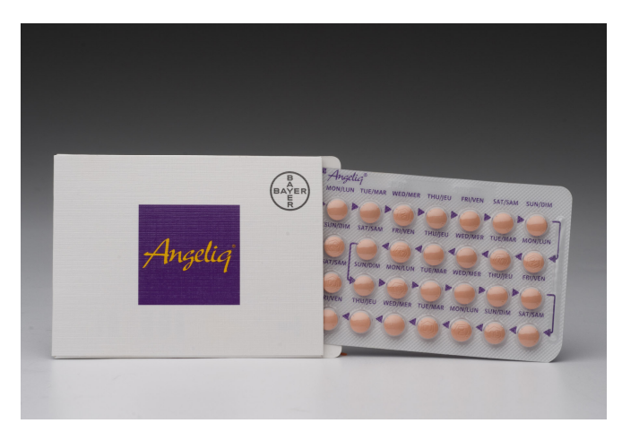
Figure 2: The main panel of the inner package for Angeliq, along with the blister pack of tablets.