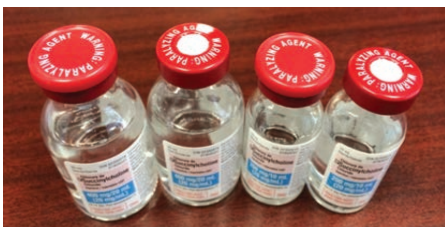
Figure 1: New labelling of succinylcholine product from Alveda Pharma. The words "WARNING: PARALYZING AGENT" are printed in white lettering on the red cap and on the red ferrule.

This improvement is an excellent example of how reports from healthcare professionals can and do facilitate changes with labelling and packaging of health products to enhance medication safety.