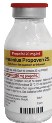
Figure 1. Propofol 2% 100 mL product imported from Europe under a Health Canada Interim Order.

Due to an impending shortage of the propofol 1% (10 mg/mL) 50 mL and 100 mL products in Canada, some hospitals may need to use a double-strength (2% or 20 mg/mL) product that is now being imported from Europe (Figure 1). Propofol 2% is a product unfamiliar to Canadian practitioners and thus carries a risk of 2-fold overdose. A multipronged systems approach, including interprofessional communications and technical safeguards, is required to avoid errors with this product. Errors may also arise once the shortage is resolved and hospitals can again stock propofol 1% 50 mL and 100 mL products.