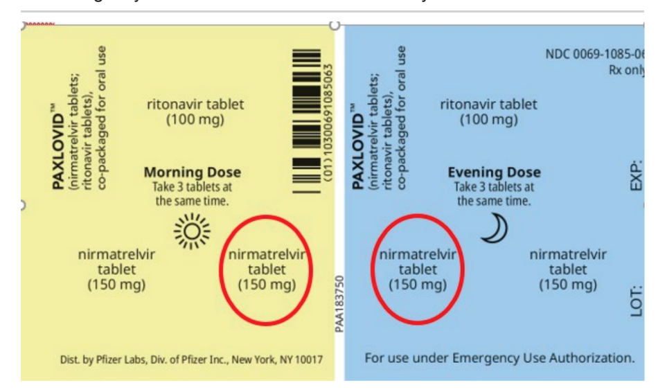
Figure 1. US Emergency Use Paxlovid blister label currently available in Canada.<sup>3</sup>

When Paxlovid is dispensed for this patient population, 1 tablet of nirmatrelvir is to be removed from the morning dose and 1 tablet of nirmatrelvir from the evening dose (see red circles in Figure 1). This step is required to dispense the recommended reduced dose of nirmatrelvir 150 mg (i.e., 1 tablet) twice daily.<sup>1-3</sup>